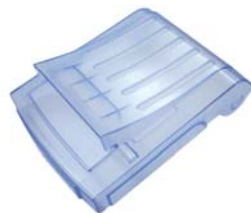
Spill proof cover